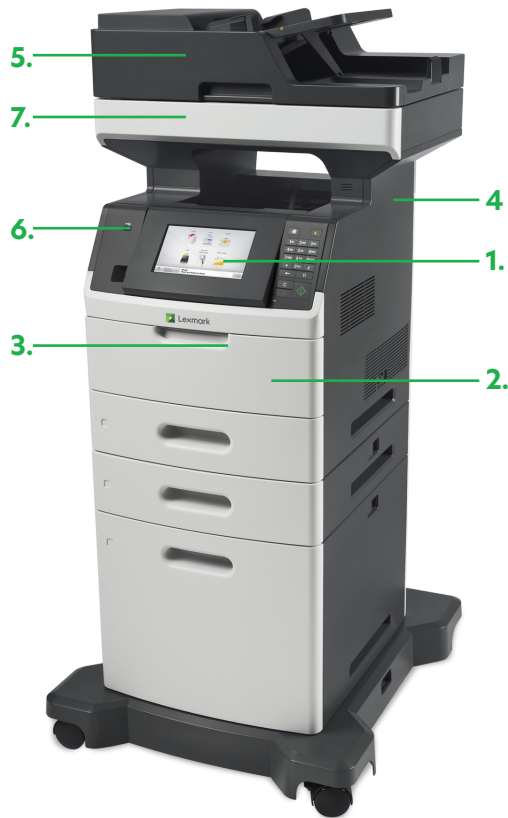
XM5163 model with 550-sheet tray, 2100 sheet tray and caster base