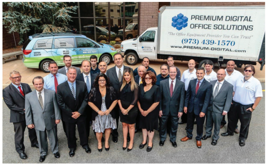
The Premium Digital Office Solutions team.