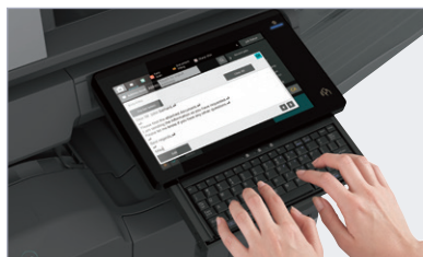
Built-in retractable keyboard simplifies email address and subject line entries.