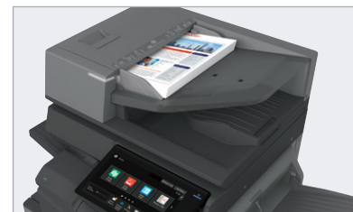
High capacity 300-sheet DSPF scans documents at up to 280 images per minute.