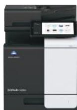
bizhub i-Series C4050i

To learn more, please visit workplacehub.konicaminolta.com