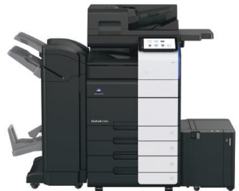
bizhub i-Series C650i