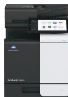
bizhub i-Series C4050i