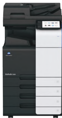
bizhub i-Series C360i