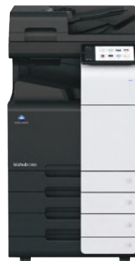
bizhub i-Series C360i