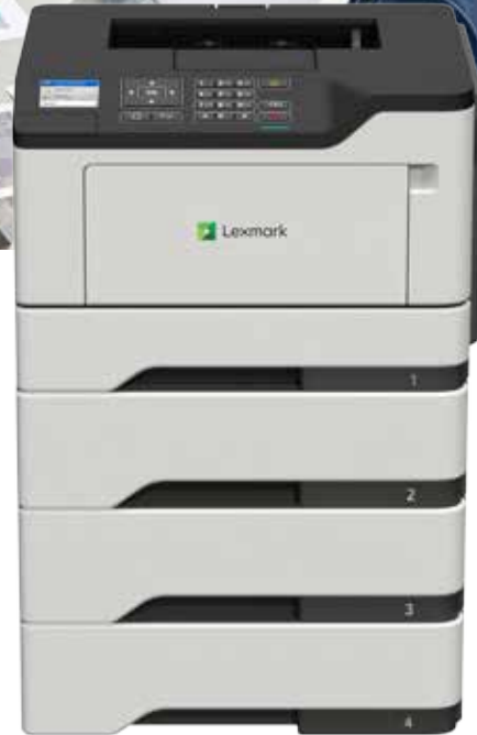
MS521dn with optional trays