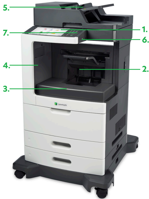
XM7263 model configured with Staple, Hole Punch Finisher