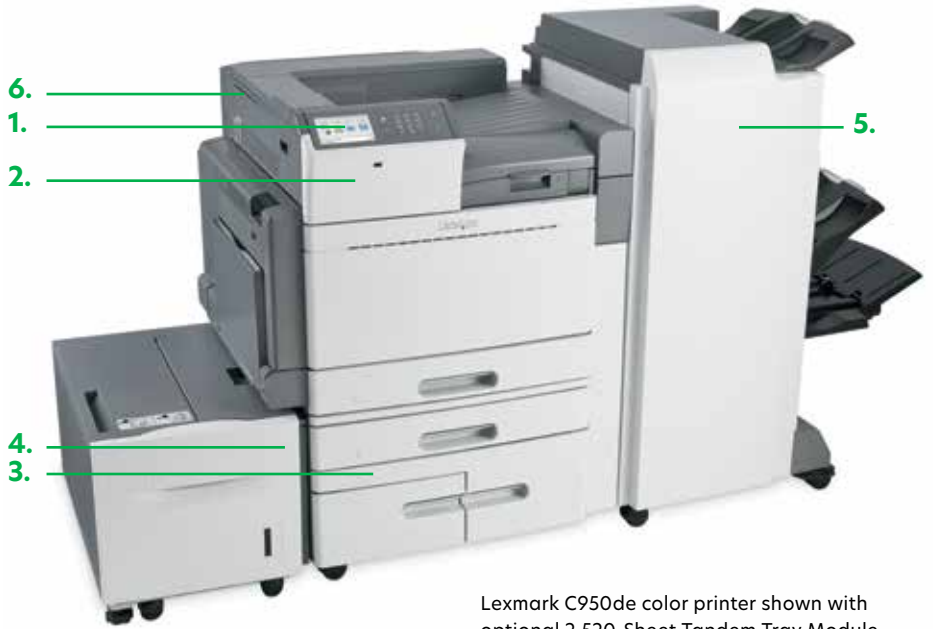
Lexmark C950de color printer shown with optional 2,520-Sheet Tandem Tray Module, Booklet Finisher and 2,000-Sheet High Capacity Feeder.

Reduce unnecessary printing and simplify work processes through solutions applications preloaded on your device. Choose additional Lexmark solutions to fit your unique workflow needs.